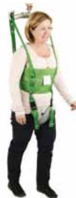
MOD. 60 Shown with optional leg straps

* Some sizes and designs with a max. load of 660-1,100 lbs (300-500 kgs).