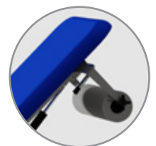
Paper Roll Holder