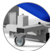
Large Castor Base